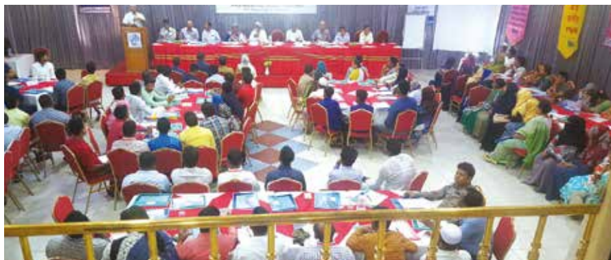
Participants in the seminar at Hotel Saint Martin Seminar Hall in Chattogram

BILS organised a half day seminar with the core organising team for orientation on plan of action, formation of sector-based batches on June 18, 2019 at the seminar hall of hotel Saint Martin, Chattogram.