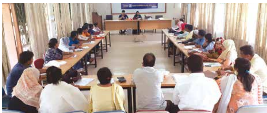
Leaders and participants in the discussion meeting at IRI Auditorium, Tongi

BILS, with the support of Mondiaal FNV organised a number of discussion meeting on finalising the guideline of Community Solidarity Forum. A discussion meeting held on June 29, 2019 at BILS Seminar Hall. The meeting was organised aiming to form area based Community Solidarity