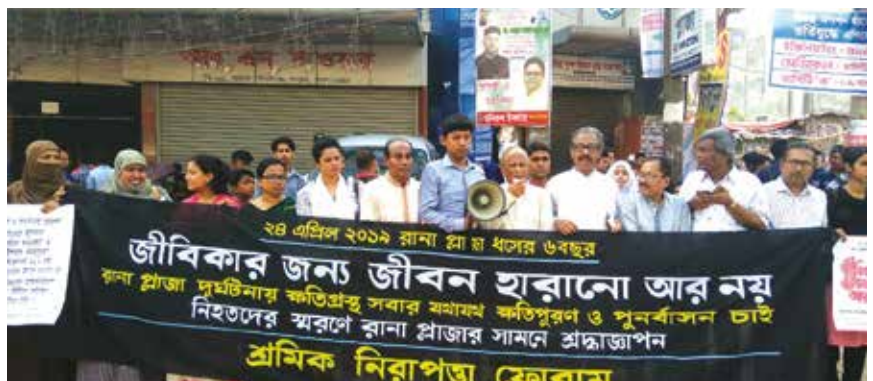
participants in the Human chain in front of Rana Plaza

Hundreds of Trade Union activists and civil society members remembered the victims of Rana Plaza Tragedy on its sixth year and demanded proper compensation for the survivors and exemplary punishment of those who were responsible for this deadly collapse. Sufferings of the survivors of