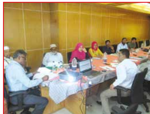
Part of civil society network meeting

A Meeting of Sromik Shanhoti Forum-Chattogram (A BILS-LRSC & Civil Society Network established under BILS-DGB-BW Project) was held on April 4, 2019 at Hotel Asian SR Seminar Hall, Chattogram.