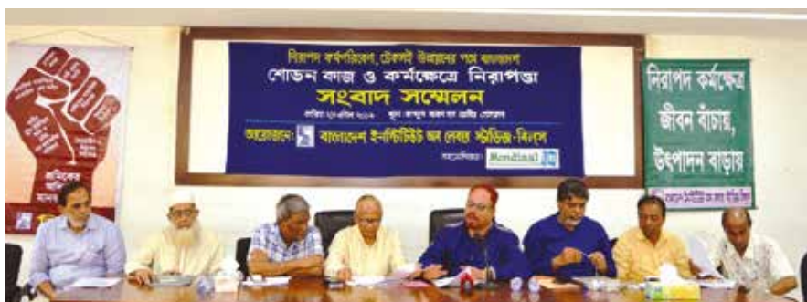
Leaders are in the press conference

BILS, on the occasion of International Commemoration Day, organized a press conference on 28 April, 2019 at National Press Club in Dhaka.