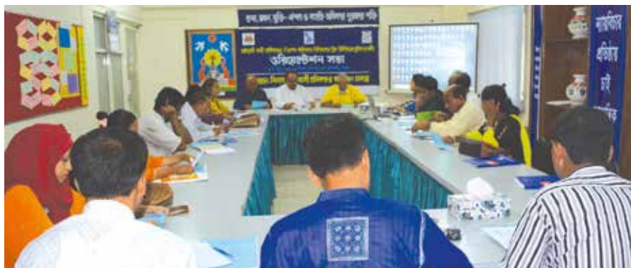
Participants in the opinion sharing meeting at BILS Seminar Hall

BILS Empowering Migrants Workers Project organised an opinion sharing meeting on role of trade union to ensure the safe migration for women workers on June 26, 2019 at BILS Seminar Hall, Dhaka.