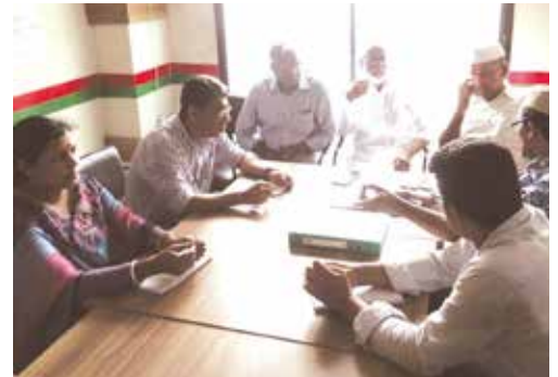
Part of coordination meeting

BILS organized a quarterly meeting of the Centre Coordination Committee which was held on May 9, 2019 at BILS-LRSC, Chattogram.