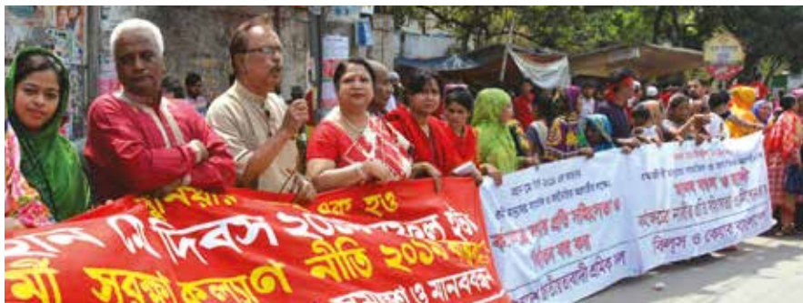
TU leaders at the human chain

BILS and its network on the demand to ensure eight hour of work, rest and holidays for the workers, organised number of events on May Day.