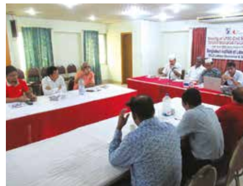
Part of quarterly LRSC- civil society network meeting

BILS organized a quarterly meeting of the LRSC-Civil Society Network (Sromik Shanghoti Forum, Chattogram or SSFC) on June 25, 2019 at the seminar hall of Hotel Regent Park, Chattogram.