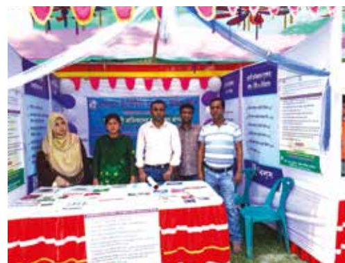
BILS Stall at Migrant Fair at Singair Upazila parishad

BILS participated Migrant Fair organised by BRAC and IOM on April 25, 2019 at Singair Upazila Parishad Complex. BILS also set up a stall where a number of publications regarding BILS activities and research report were displayed.