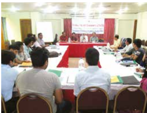
Participants in the training

A three day training program of the trainers (ToT) as part of capacity development of the Core Organising Team was held on April 25-27, 2019 at Hotel Regent Park Seminar Hall, Chattogram.