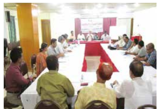
Participants in the consultation meeting

BILS, organized a leadership consultation meeting held on June 25, 2019 at the seminar hall of Hotel Regent Park, Chattogram.