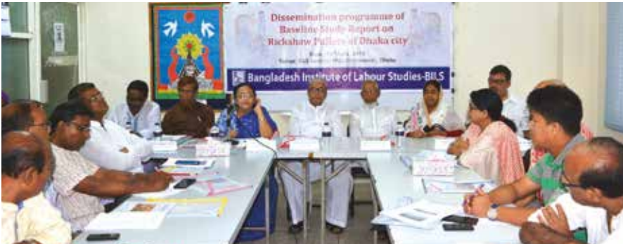
Leaders and participants at the research report sharing meeting