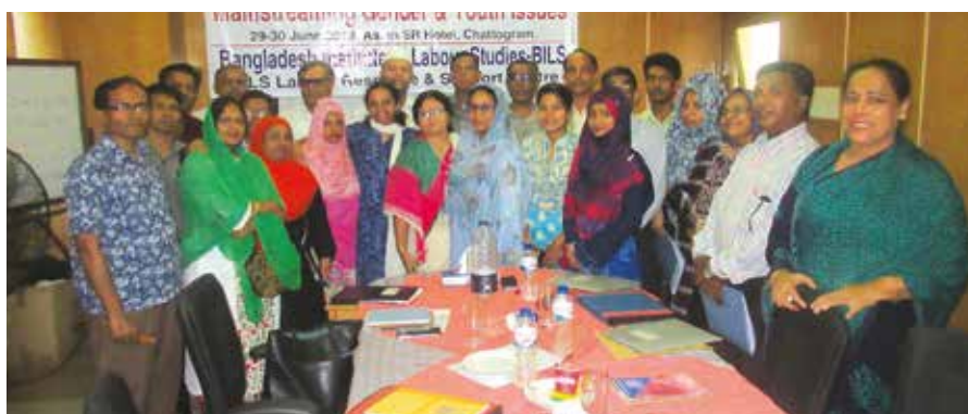
Leaders and participants of the workshop

BILS organized a two day workshop on "Mainstreaming Gender & Youth Issues" on June 29-30, 2019 at the seminar hall of Hotel Asian SR, Chattogram.