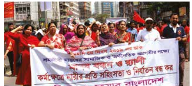
Part of rally observing May Day