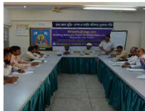
Part of review and coordination meeting held in Chittagong

As part of the BILS- DGB-BW project activity, a quarterly periodical review and coordination meeting of the BILS young organisers team was held on October 29, 2018 at the Seminar Hall of Hotel Mishkah in Chittagong.