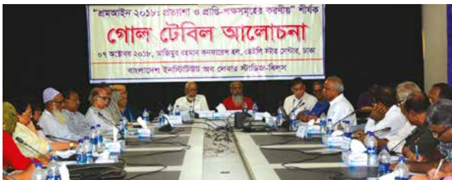
Discussants are in the roundtable for reviewing the existing situation of Labour Law

BILS organised a roundtable titled "Labour Law 2018 : Expectations and achievement-Practicable of Parties" on October 7, 2018 at Azimur Rahman Conference Hall in The Daily Star Centre aiming to review the existing situation of