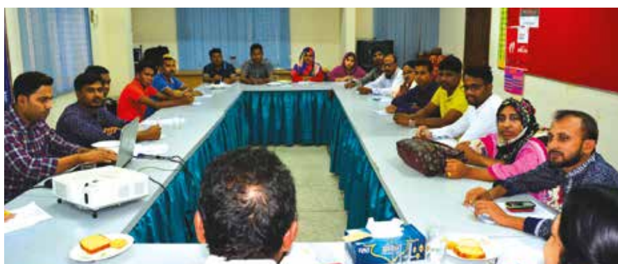
Participants in the area based planning meeting

BILS, with the support of Mondiaal FNV organised an area based planning meeting on October 14, 2018 at BILS Seminar Hall. The meeting was organised aiming to coordinate area based committees regularly, to contribute in protesting violation of workers'