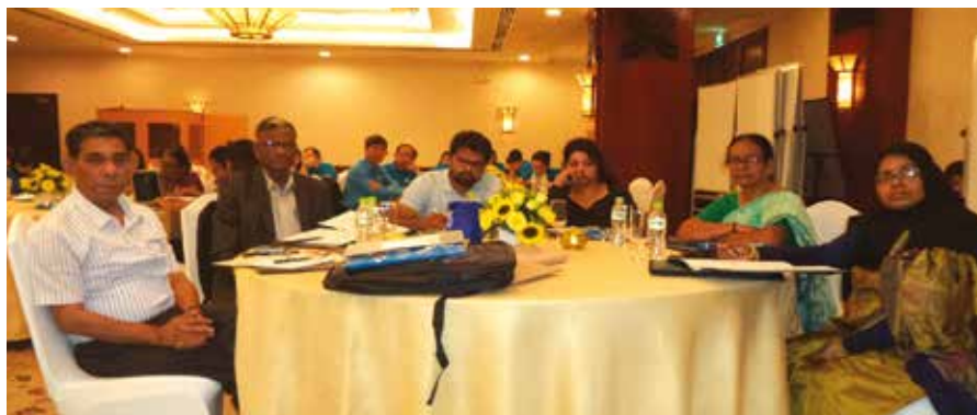
BILS representatives are in the international conference on women and informalisation of work

As part of the Asia Regional Activity 2018, in cooperation with the DGB Bildungswerk, the Vietnam General Confederation of Labour (VGCL) organized a five day conference titled, "Women and Informalisation of Work: A Future Search" on October 7-11, 2018 in Ho Chi Minh City, Vietnam. The conference was organised aiming to co-create future scenarios for women