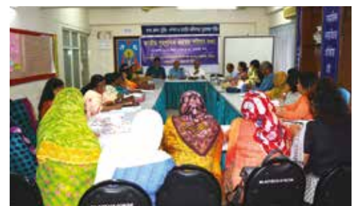
Participants in advance training on protesting gender base violence at workplace

BILS, with the support of Mondiaal FNV organised a two-day training titled, "Advance Training on Protesting Gender base Violence at Workplace in RMG Sector" on November 3-4, 2018 at BILS Seminar Hall. The training was organised aiming to set activities of Trade Union for protesting gender base violence at