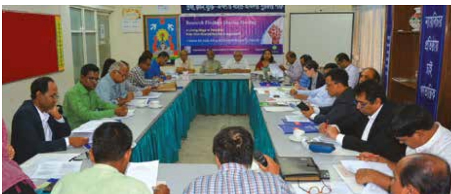
Participants are in an open discussion in research findings sharing meeting

A research findings sharing meeting titled, "A Living Wage is Possible: Role from Brands/ Buyers is Important" was held on November 11, 2018 at BILS Seminar Hall. Sharing the research findings and taking directions from the discussants through an open discussion was the main objective of