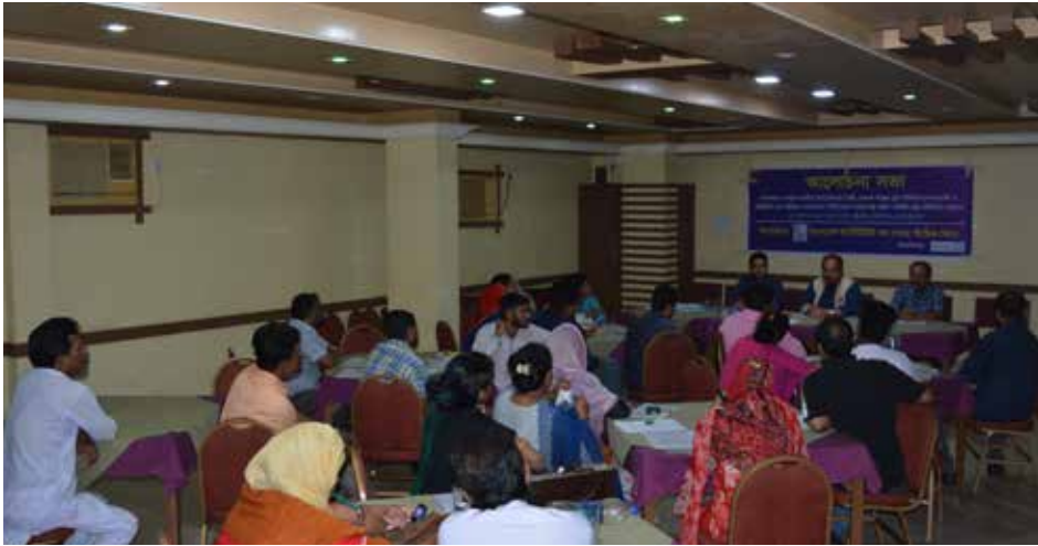
Part of discussion meeting held in Narayanganj