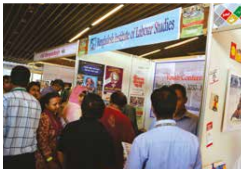
BILS Stall in the Youth Conference 2018

Citizen Platform Bangladesh on Implementing SDG organised a Youth Conference titled, "Bangladesh and Agenda 2030: Expectation of Youth" on October 14, 2018 at Krishibid Institution Auditorium where BILS participated as a