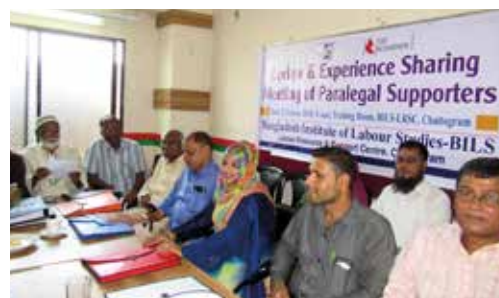
Part of review and experience sharing bi monthly meeting

A review and experience sharing bi monthly meeting of BILS Paralegal Supporters Team was held on October 22, 2018 at the BILS-LRSC Seminar Hall in Chittagong. The meeting was organised aiming to review the earlier activities of the team and encourage team members to be more pro-active in terms of providing paralegal support to victim