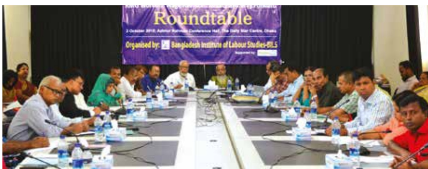
Discussants are in the roundtable on RMG Workers' Wage Revision

Bangladesh Institute of Labour Studies-BILS, with the support of Mondiaal FNV organised a roundtable titled "RMG Workers' Wage Revision: Reality and Way Forward" on October 2, 2018 in