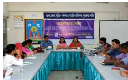
Part of discussion meeting with Dhaka-Mirpur area Trade Union leaders

BILS, with the support of Mondiaal FNV organised a discussion meeting with the participation of Dhaka-Mirpur area Trade Union leaders on October 24, 2018 at BILS Seminar Hall. Main objectives of the meeting were to finalize the draft work plan which was prepared on previous planning meeting and to set the activities for conducting and implementing area based campaign activities.