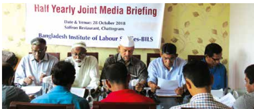
Part of half yearly joint media briefing