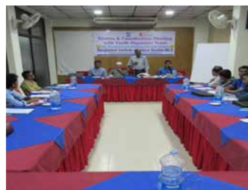
Part of review and coordination meeting held in Chittagong

BILS organised a workshop on determining advocacy strategy for ensuring rights and social safety of rickshaw-van puller in Dhaka city on November 1, 2018 at BILS Seminar Hall. The workshop was organised aiming to determine an advocacy strategy for