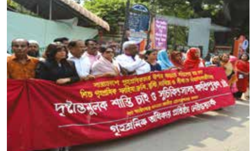
Leaders demand punishment to the torturers of child domestic workers