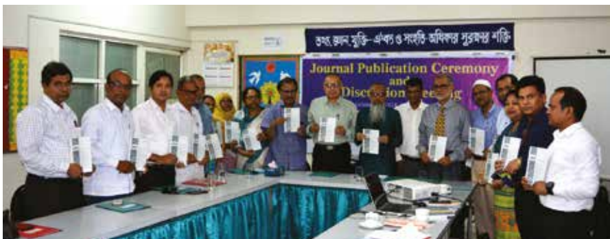
Guests unveil the BILS journal in the meeting

BILS, with the support of Friedrich-Ebert-Stiftung organised a journal publication and consultation meeting on October 28, 2018 at BILS Seminar Hall with the participation of Trade Union leaders and academicians.