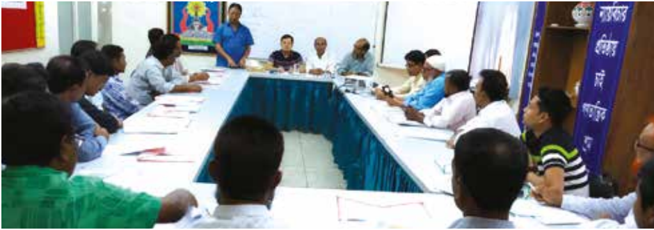
Part of Capacity building training of discussion circle

BILS organised a two-day capacity building training of discussion circle of rickshaw-van pullers on November 16-17, 2018 at BILS Seminar Hall. Informing the participants on socio-economic situation, society, communication system and contribution of rickshaw-van pullers in national economy, legal rights of rickshaw-van puller, existing Labour Law, conditions from City Corporation, traffic rules, initiatives of social safety, initiatives of organising rickshaw-van pullers were the