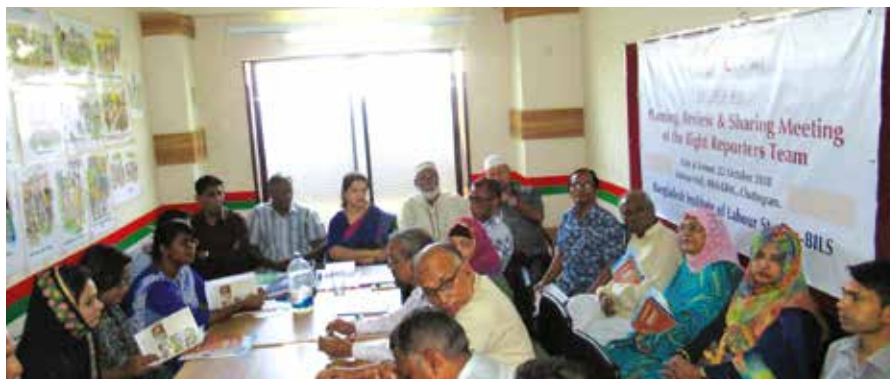
Chittagong Trade Union leaders are with Right Reporters team

A Review and Experience Sharing Bi Monthly Meeting of the BILS Paralegal Supporters Team was held on October 22, 2018 at the Seminar Hall of BILS-LRSC, Chittagong.