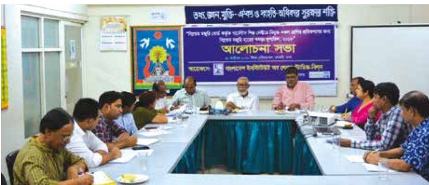
Part of discussion meeting on minimum wage at RMG sector

BILS, with the support of Mondiaal FNV organised a discussion meeting titled "Draft Recommendation, 2018 of Minimum Wage for All Categories of Workers in RMG Sector by Minimum Wage Board" on October 20, 2018 at BILS Seminar Hall.