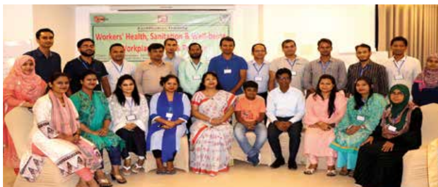
Part of certification training programme

As a part of BILS-SNV project activities a two day long certification training on 'Workers' Health, Sanitation and wellbeing at workplace: Laws and Policies' was held on October 6-7, 2018 at Marino Royal Hotel, Uttara in Dhaka With a specific focus on the workers' health and wellbeing of