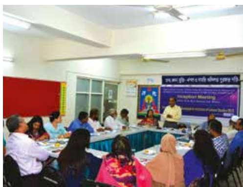
Part of inception meeting for preparing research outline and taking direction from participants

An inception meeting titled, "Study to Analyze the Role of Different Authorities in Industrial Dispute Settlement and Developing Comprehensive Recommendations for RMG and Water Transport Sector" on October 9, 2018 at BILS Seminar Hall. Preparing a research