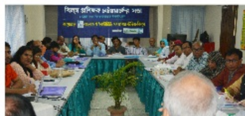
Participants in the BILS Trainers Network Conference 2017, organized for discussing various issues including the proper utilization of labour law, development of labour efficiency

BILS, with the support of Mondiaal FNV organised BILS Trainers Network Conference 2017 on November 4, 2017 at BILS Seminar Hall to take opinion and recommendations from the members of BILS Trainers Network.