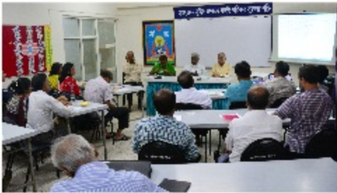
Part of workshop on preparing amendment proposal regarding Labour Law 2006 with the presence of BILS Secretary General Nazrul Islam Khan along with other Labour Law experts

Bangladesh Labour Court Bar Association and BILS jointly organised a workshop on Preparing Amendment Proposal for Bangladesh Labour Law 2006 on October 7, 2017 at BILS Seminar Hall. The workshop