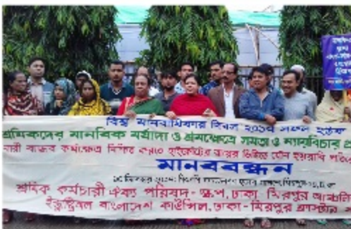
Leaders in the observation of Human Rights Day 2017 through domestic workers rally, procession and human chain with the participation of various human rights organisations

Rally, human chain along with various activities were organised to observe Human Rights Day 2017 at different parts of the country.