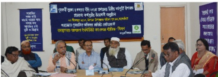
Discussants in the consultation on sharing of Domestic Workers Protection and Welfare Policy 2015, held at Trishal Upazila Parishad Hall Room, Mymensingh

BILS, with the support of Oxfam Bangladesh organised a consultation titled "Sharing of 'Domestic Workers Protection and Welfare Policy- 2015' with the Public representatives and civil society" was held on December 29, 2017 at Trishal Upazila Parishad Hall Room, Trishal, Mymensingh.