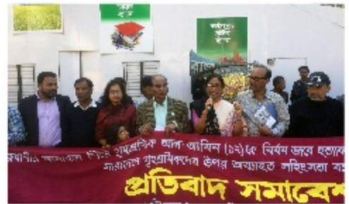
Leaders in the human chain in front of National Press Club drawing attention to the mass people and concerned departments in order to stop violence against workers, protect and ensure their security

Sramik Nirapotta Forum and Domestic Workers Rights Network-DWRN jointly organised a human chain and procession on December 30, 2017 at National Press Club. Main objective of the programme was to draw attention to the mass people and concerned departments in order to come forward for stopping violence against workers, protecting them as well as ensuring their security.