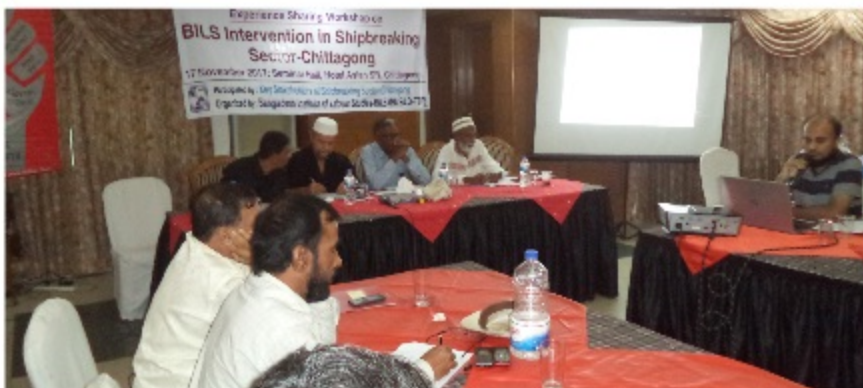
Discussants in the research workshop on ship breaking sector

With a view to document the achievements and fix the future priorities in Ship breaking sector, BILS has conducted a research. In connection with this, under LO-FTF project, BILS organised, a workshop titled "BILS intervention in Ship breaking Sector-Chittagong" held at the seminar