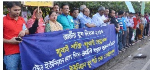
Participants observing National Youth Day to create awareness among the public about the importance of youth society in the national issue

BILS formed a human chain to observe National Youth Day 2017 on November 1, 2017 In front of National Press Club aimed at motivating BILS Youth Organisers Team, raising awareness among mass people to define the importance of young people in National issues as well as Trade Union. Main objective of the programme was to disseminate the spirit of youth mobilization.