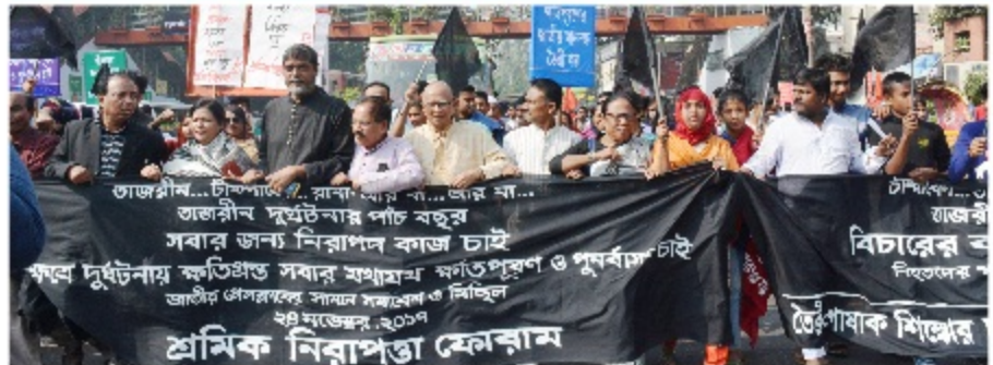
TU leaders and Civil Society members in the procession recalling the deceased workers of Tazreen Fire in front of National Press Club

Various activities were organised in different parts of the country recalling the deceased workers of Tazreen Fire.