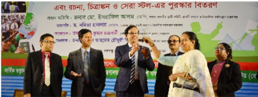
BILS received award through participation in the fair organised on the occasion of International Migrants Day 2017

"Safe migration where, there is sustainable develop" following this slogan BILS participated in rally and discussion meeting in observing International Migrant Fair 2017, organised by Ministry of Expatriates' Welfare and Overseas Employment on December 18, 2017 at