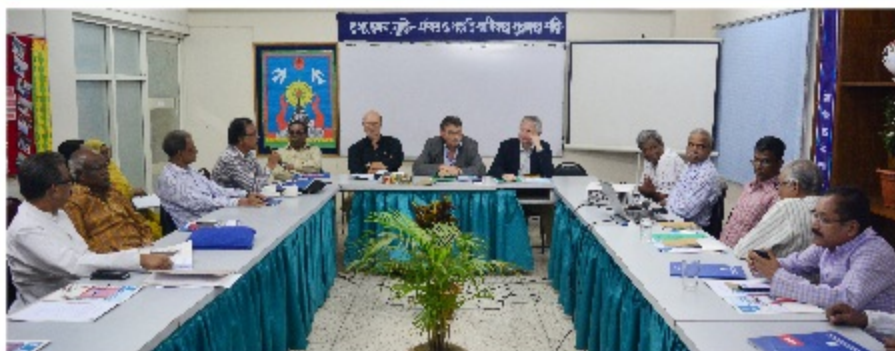
LO-FTF Council Representatives addressed BILS Advisory and Executive Council Members in the meeting discuss BILS activities for improvement of workers' life style in current context of Bangladesh

As a part of LO-FTF Council mission to Bangladesh for extending and reviewing its partnership, a meeting held between LO-FTF Council representatives and BILS Advisory and Executive Council Members on November 14, 2017 at BILS Seminar Hall.