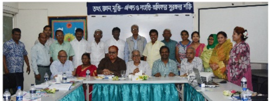
BILS and Indian Trade Union Leaders in a sharing meeting aimed at discussing BILS activities regarding trade union movement and trade union leadership

As a part of visit of Indian Trade Union Leaders under the BILS-FNV Project, a sharing meeting was organised by BILS on October 25, 2017 at BILS Seminar Hall. Informing them about Trade Union movement in Bangladesh, BILS activities and ongoing Labour Law process with