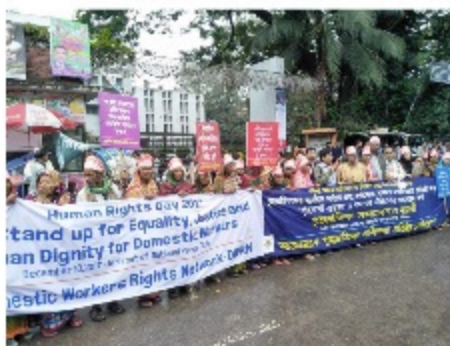
Participants in human chain in front of National Press Club urged to take initiatives for implementing 'Domestic Workers Protection and Welfare Policy 2015' and to stop torturing domestic workers

which happened five years ago. In memory of those workers, SNF paid homage to Jurain Graveyard early in the morning. A gathering and a procession were held afterward in front of the National Press Club. "We demand safe jobs for everyone, compensation and rehabilitation for the victims" with this slogan the rally was shrouded.