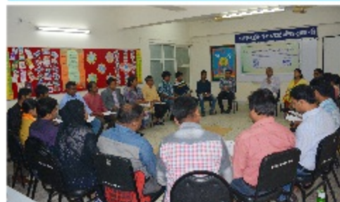
Participants in the regular thematic study circle for Youth Leadership of National Federations organised aiming to discuss Trade Union related various issues

BILS, with the support of Friedriche-Ebert-Stiftung (FES) organised a regular thematic study circle with the participation of Youth Leadership of National Federations on November 28, 2017 at BILS Seminar Hall. The programme was organised aiming to discuss about team features and team behavior, Trade Union definition, policy and rights, effective listing skill and Labour Law.